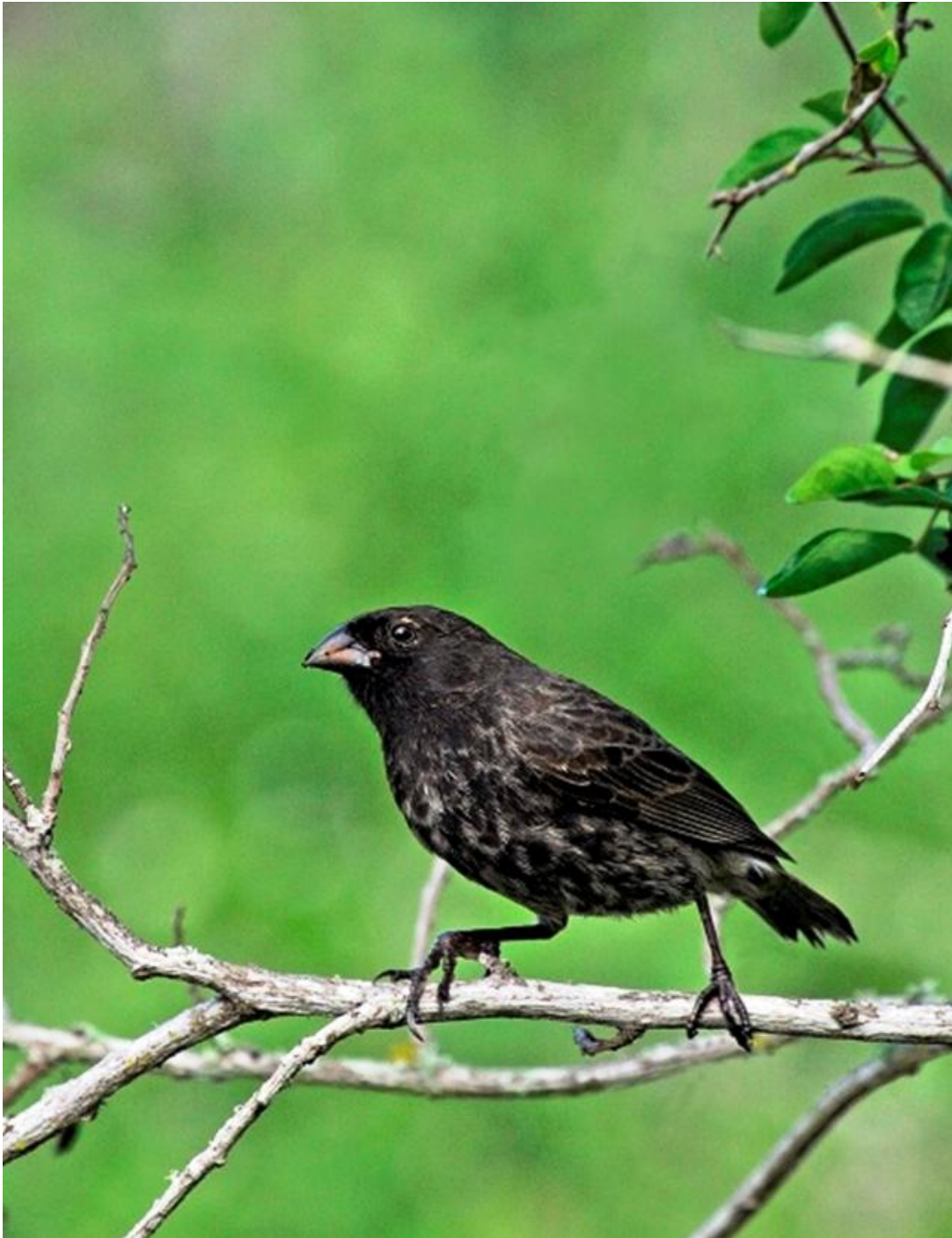
Figure 1: Darwin's small ground finch Geospiza fuliginosa (male aged 3-4 years).

The island of Santa Cruz is the second largest (986 km 2 ) and highest island (850 m a.s.l.) in the Galápagos Archipelago. It is roughly circular in shape with its highest points in the centre (see Chapter 2 [Fig. 1]); it is also middle aged for the islands in the archipelago, with no obvious crater and a considerable deposit of soil in the highlands. Rainfall (and precipitation