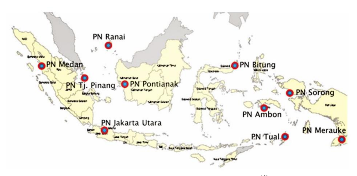
Figure 3 the Location of Fisheries Courts in Indonesia. 161

Special fisheries courts are established in the area of port locations which become the most frequent place to process fisheries crime offenders. Currently, there are ten fisheries courts. These have been established in Jakarta, Medan – North Sumatera, Pontianak – West Kalimantan, Ambon – Maluku, Bitung – North Sulawesi, Tual – Maluku, Tanjung Pinang – Riau Islands, Ranai – Natuna (Riau Islands), Merauke – Papua, and Sorong – Papua. <sup>160</sup> Figure 3 shows the locations of these special fisheries courts in Indonesia.