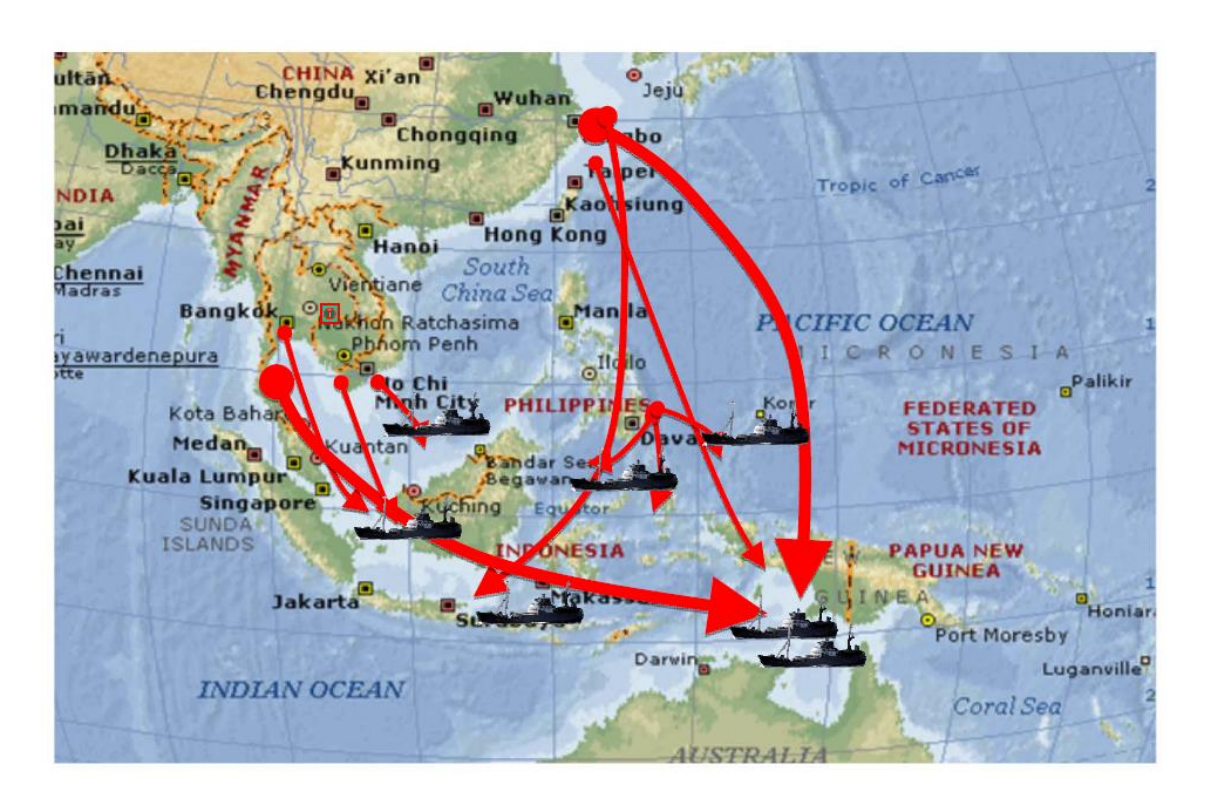
Figure 2. Origin and Routes of Foreign Illegal Fishing to Indonesia's EEZ and Territorial Seas. 109

As the biggest archipelagic state, Indonesia's islands are scattered between the Pacific and Indian oceans. This provides many channels to sail through Indonesian waters. Accompanied with the freedom of navigation right for all foreign fishing vessels, Indonesian waters are very vulnerable to IUU fishing. Below, Figure 2 illustrates the origins and routes used by the FFV poachers who enter Indonesia's waters and EEZ.