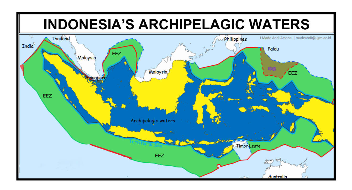
Figure 5 Indonesia's Archipelagic Waters. 78

Tommy T.B. Koh, the president of The Third United Nations Conference on the Law of the Sea (UNCLOS III), argues that one of the reason the LOSC is worthy of praise is its success in fulfilling the developing coastal states' demand for better equity in accessing the ocean's fisheries against developed states who benefit from the freedom of the sea principle and advanced technology. This was embodied in the LOSC provisions that grant the wider territorial sea, and the new regime of the Exclusive Economic Zones (EEZs). However, the LOSC also preserves the hegemony of developed states by the ambiguity of the LOSC provisions regarding the freedom of navigation and law enforcement, as well as the ambiguity of the LOSC provisions on fisheries management and conservation. Indeed, the history of the LOSC reveals that the extension of the territorial sea and the establishment of EEZs was not to fulfil the interests of the developing coastal states alone. In fact, the developed states were