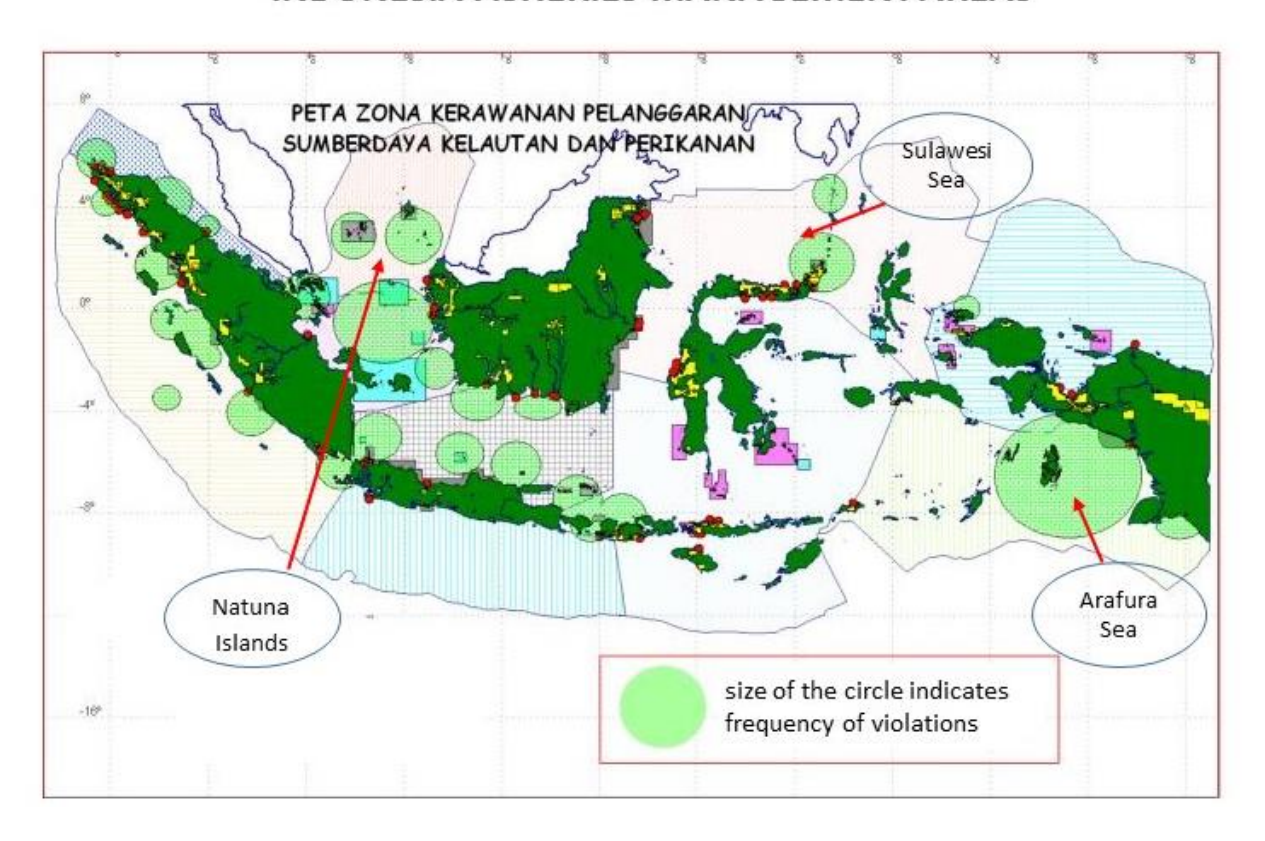
Figure 1. Fisheries Violations Hotspots Maps. 19

In defining the IUU fishing phenomenon in Indonesia, some scholars try to emphasise the three prongs of IUU fishing in Indonesia's internal waters, territorial seas (including archipelagic waters) and EEZ: illegal, unreported and unregulated. However, this chapter finds that overwhelmingly the categorisation of unreported and unregulated fishing made by scholars in regards to fishing activities by Indonesian small-scale fishers, has blurred the real problems that Indonesia faces in combating IUU fishing in its jurisdiction. The problems are related to the uniqueness of Indonesia's geographical situation, the characteristic of Indonesian small-scale fishers, and Indonesia's capacity to conduct surveillance over its waters.