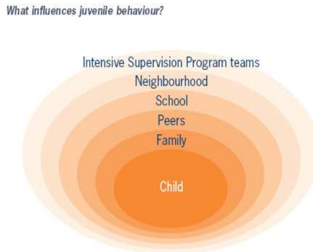
Figure 3.1 What Influences Juvenile Behaviour

Source: Government of Western Australia, Department of Justice Document: "Reducing Juvenile Offending" (Thompson and O'Connell 2008)