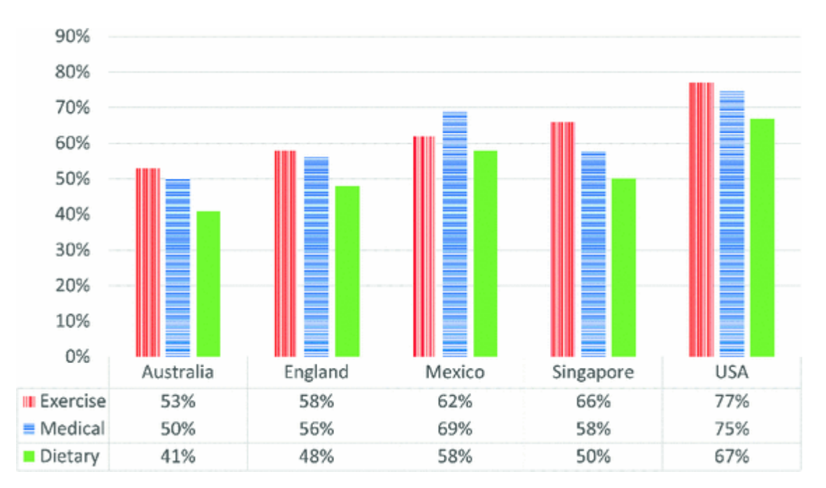
Figure 1 - Use of Wearables in Different Countries (Saa et al., 2018)

Previously the use of this wearable technology was in the field of military and defence and has since shown to have had substantial benefit in healthcare. Nowadays, the wearables are mainly growing in the fields of health, fitness and dietary. Considering this demand, we can see from Figure 1 that the wearable is more popular in the medical field compared to other fields. (Saa, Moscoso-Zea, & Lujan-Mora, 2018).