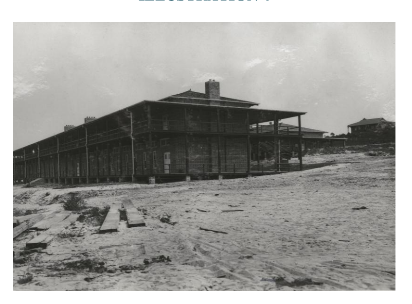
Women's Hospital, Waterfall Sanatorium, New South Wales circa 1912