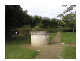
6. Well near the vegetable gardenBoth at Fontevraud abbey.

the buildings restored to the way they were originally. A significant part relates to the twelfth century. It differs from the Abbey of St Hildegard because it does not house a group of Benedictine men or women now. It is steeped in history, but also caters to modern times in the performance of concerts, art exhibitions and conferences.