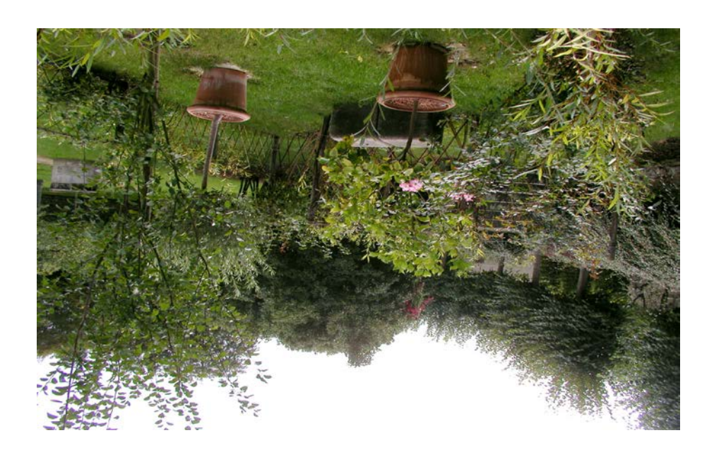
Des palissades dosier tressé, comme ce devait être la mode, protégeraient cet endroit et des plantêes fleuries, plantées dans de petites banquettes, viendraient égailler chaque saison. A sa demande, des plantes particuliéres viendraient symboliquement, lui rappeler divers événements ou étapes de sa vie. (Notice board next to Le Jardin d'Aliénor, Fontevraud)<sup>205</sup> 8. Eleanor's Garden, Fontevraud

A village grew up around the abbey, and walking around those parts near the walls of the abbey it is easy to mentally reconstruct earlier times. In the centre of the village is St Michael's church, endowed by Henry II, built between 1150 and 1162.