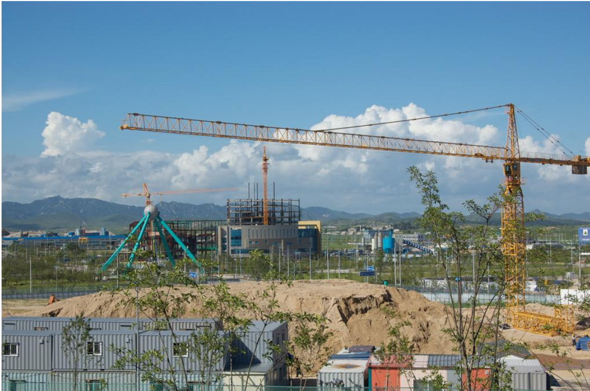
Figure 4: Construction of an extension to the Kaesong industrial zone, July 2008.

The Kim regime accumulated approximately US$20 million in revenue from several sources in the Kaesong special economic zone, including leasing fees and taxes on the salaries of North Korean workers. 96 Southern firms do not hire North Korean workers directly, but are recruited through a North Korean government agency that retains almost half of the workers' monthly pay of US$57.50 to cover social security, transportation and other costs. South Korean companies pay wages to the North Korean recruitment agency in hard currency, which the agency then converts into North Korean won at the greatly over-valued official exchange rate, leaving workers with a take-home pay of around US$2.00 a month. 97