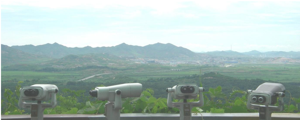
Figure 3: Looking across the DMZ at the denuded landscape surrounding the Kijong-dong peace village in North Korea, as seen from the Dorasan Observatory, July 2008.

come back to haunt the regime. Mountains were terraced too steeply, which along with deforestation has contributed to soil erosion of the denuded hills (see figure 3). This has severely reduced their water catchment capacity and led to increased intensity of flooding events in the land below. Land reclaimed from the sea suffered from high salinity and would not support food crops, despite the massive use of chemical fertilisers. 72 Kim's industrial agriculture project was no match for the limitations imposed by the natural environment.