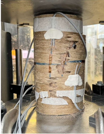
7-Day Salt 1