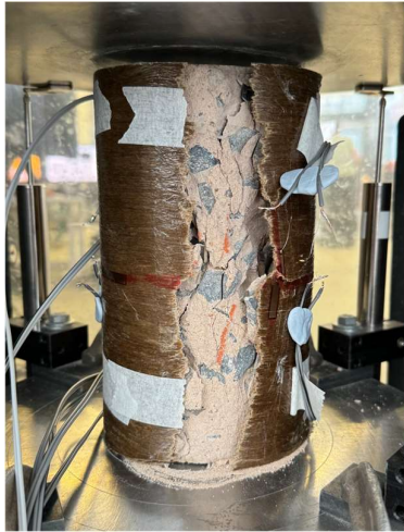
28-Day Oven 1