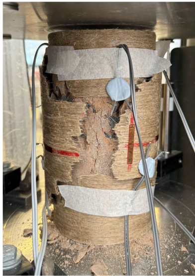
14-Day Salt 1