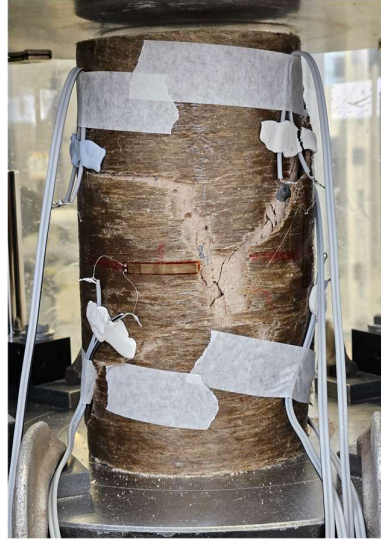
7-Day Oven 2