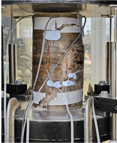
3-Day Oven 1