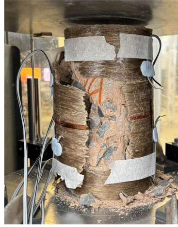
Control Sample 2