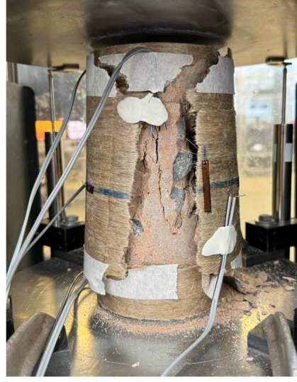
7-Day Salt 2