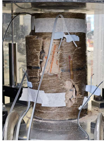
3-Day Oven 2