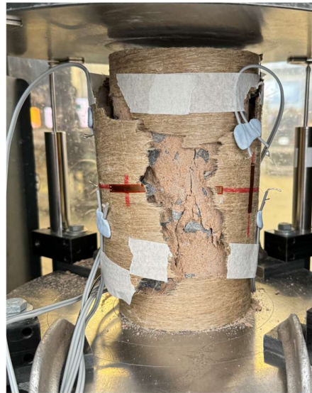
14-Day Salt 2