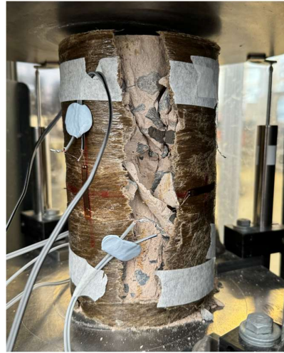
28-Day Oven 2