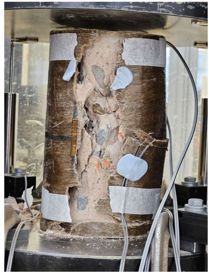
14-Day Oven 1