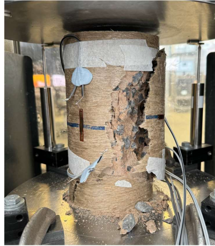
28-Day Salt 2