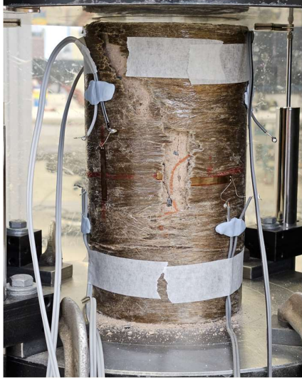
7-Day Oven 1