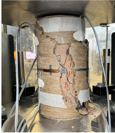
28-Day Salt 1