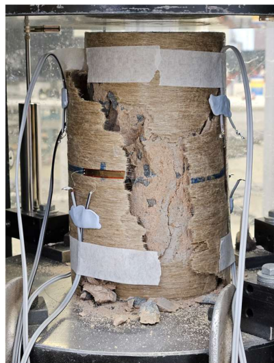
3 Day Salt 2