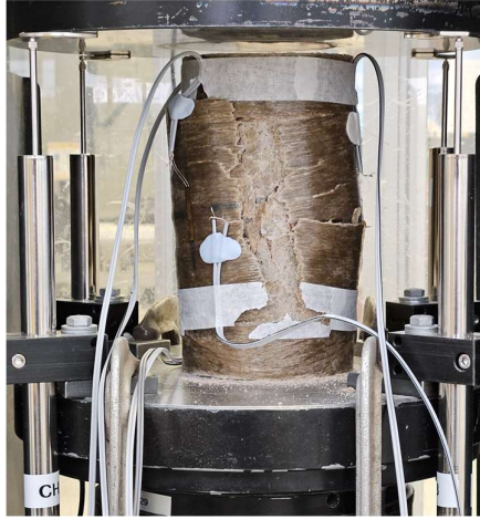
Control Sample 1

The failure mode for all the composite samples is given in the photographs below.