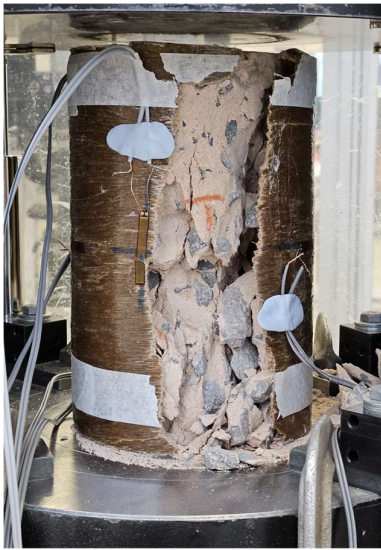
14-Day oven 2