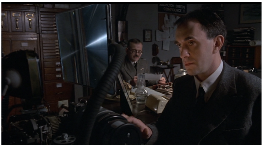
Figure 1. Brazil (Gilliam, Stoppard, Cassavetti, 1985)

shoot the film using the traditional coverage technique of shot/reverse shot plus a master would require either the reduction of scenes or the inclusion of more shooting days than we could afford. The director, therefore, in conjunction with the cinematographer needed to establish a style of shooting that used a minimum number of set ups. Wide angle lenses exaggerate perspective, emphasising the foreground whilst diminishing the background. They also increase depth of field allowing more elements in the frame to be simultaneously in focus. A wider angle not only gave us the ability to include a greater variety of detail, but also better suited our actors, most of who came from theatre, rather than film or television. Cinematographer Gustavo Mercado (2011) suggests wide framing is ideally suited to allow body language and facial expressions to convey dramatic content (pp. 97, 99). This is a technique used widely by Terry Gilliam in Brazil (1985) in order to emphasise the absurdity of an oppressive bureaucracy (see Fig. 1). In this scene the width of the angle allows the filmmaker to depict cluttered, dysfunctional bureaucratic machinery being manipulated successfully by the protagonist in the foreground, while the middle manager character cowers in the background, all in one frame.