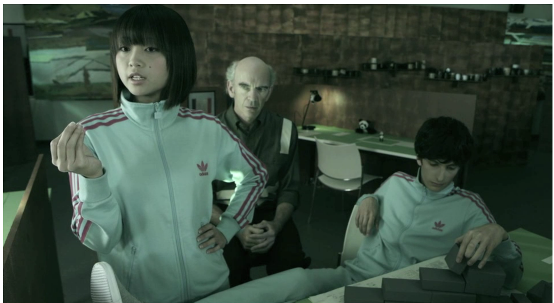
Figure 2. Double Happiness Uranium (Hawkins, Larsen, Young, 2012)

Using a wider angle could be the most effective use of our shooting asset, the high end HD camera, within our limited time. The task now was to turn this particular use of the asset into a style that was appropriate to the tone and to incorporate this into the screenplay. The tone in relation to the corporation was one of humour, the angle was wide and the performers mainly from theatre. All this suited a form of theatrically absurd satire. Scenes could be shot at a wide angle making best use of the actors' gestures and performance capabilities. The scene depicted in Figure 2 represents the virtual world of Reuben's computing environment. The central processing unit , represented by the female figure in the foreground, interacts with the memory , represented by the male figure at the right of frame, while the protagonist Reuben sits diminished and powerless in the background. In this scene it is staging and performance, rather than editing, which depicts dramatic action and power relationships.