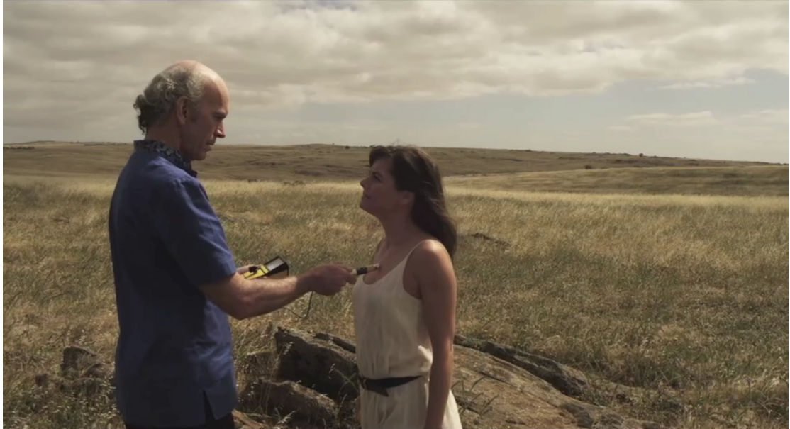
Figure 4. Double Happiness Uranium (Hawkins, Larsen, Young, 2012)

Reuben is reminded of his former friend's demise and witnesses her refusal to blame him for it (see Figure 4).