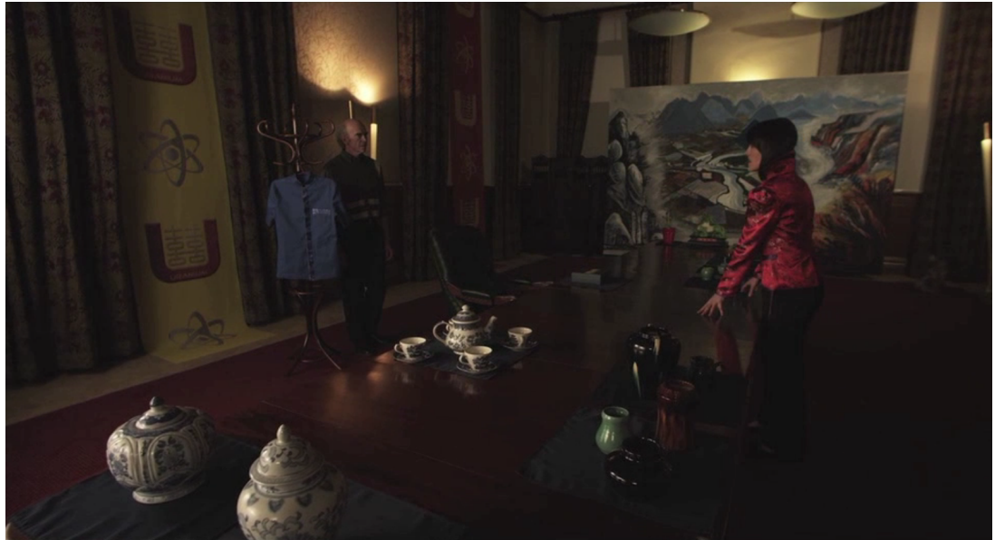
Figure 3. Double Happiness Uranium (Hawkins, Larsen, Young, 2012)

Locations could also be used to maximise their theatricality. The boardroom of RiAus for example served our purposes well with its Edwardian style juxtaposed with the sci-fi elements inherent in the costume and props (See Figure 3).