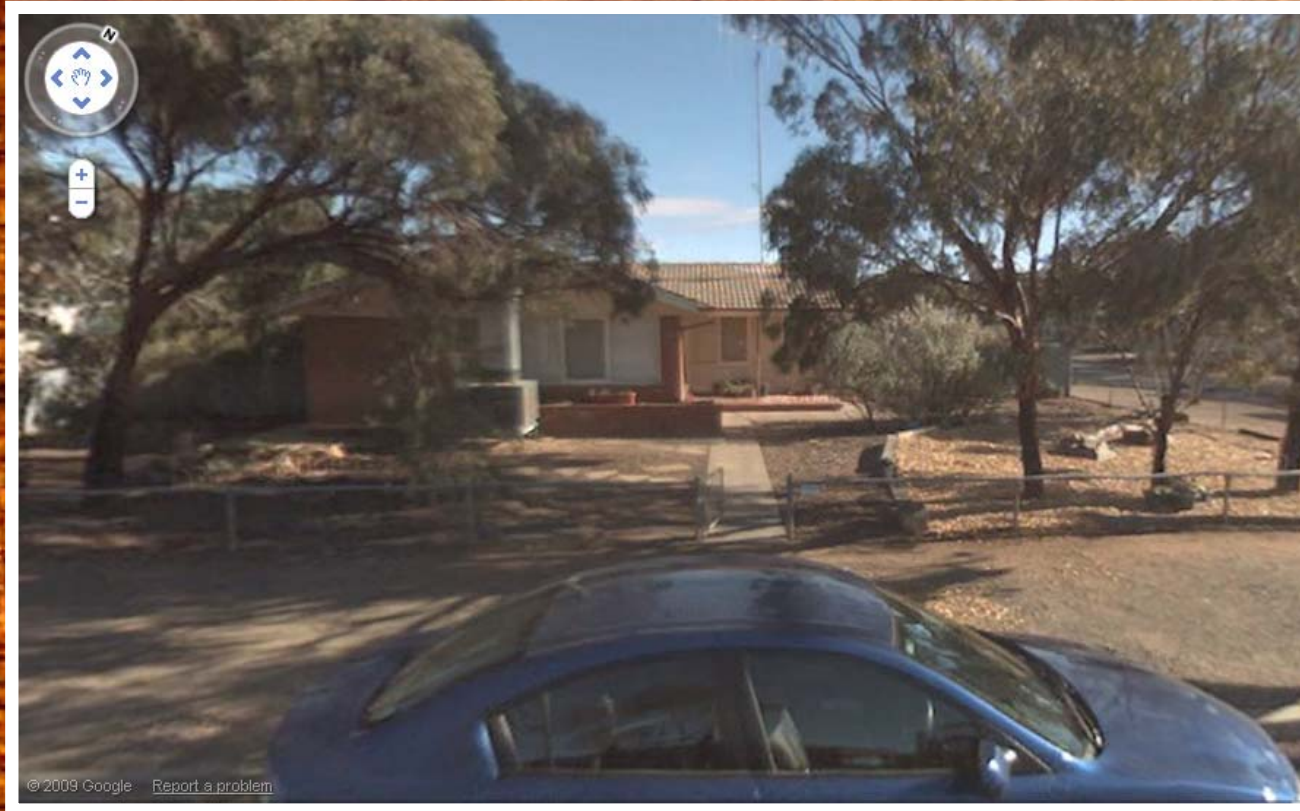
Teacher housing with girlfriend