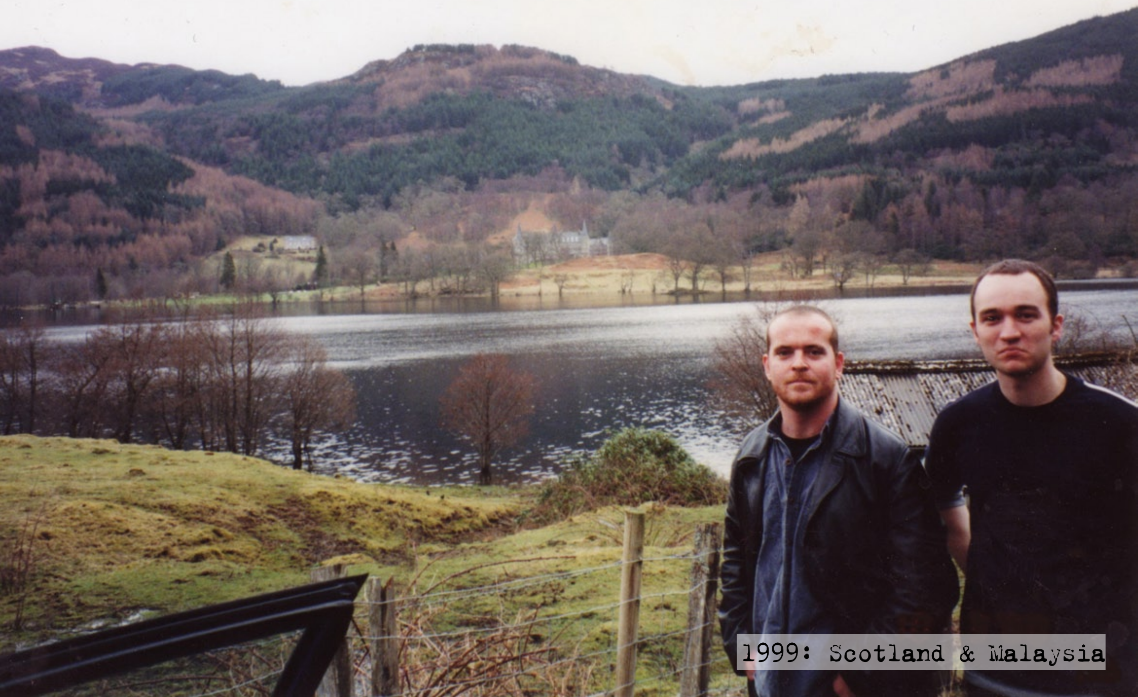
1999: Scotland & Malaysia