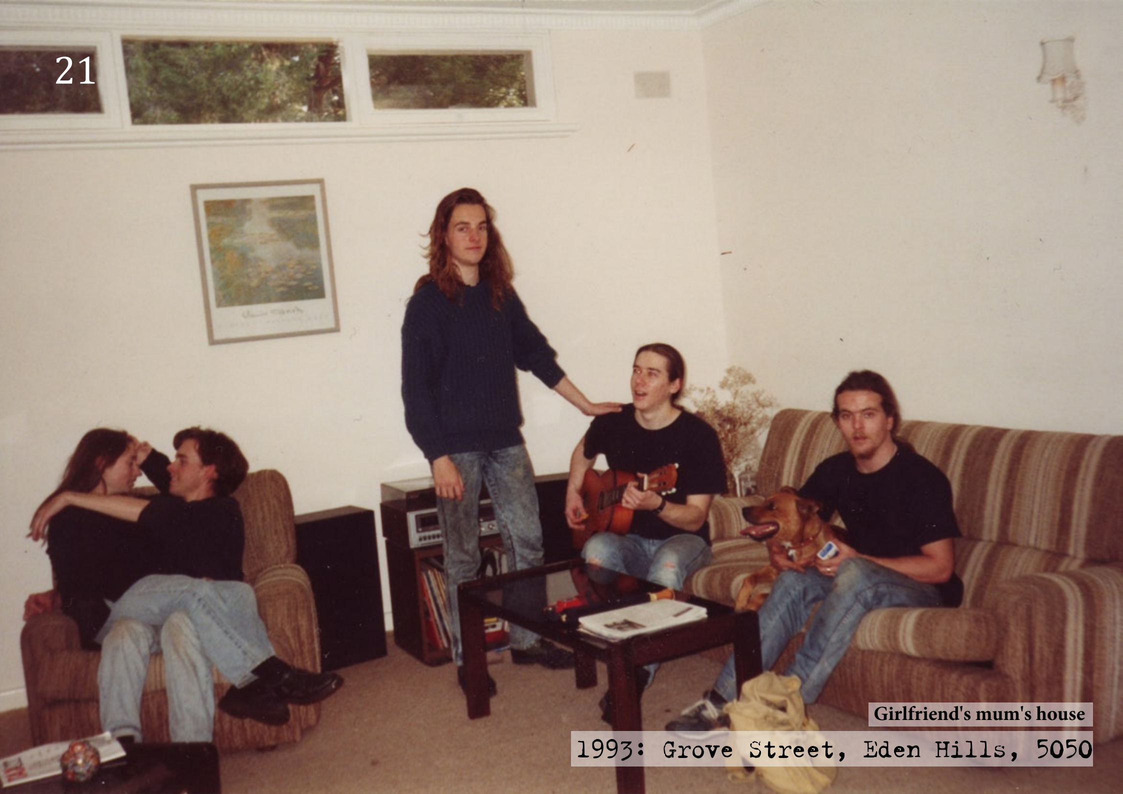
Girlfriend's mum's house