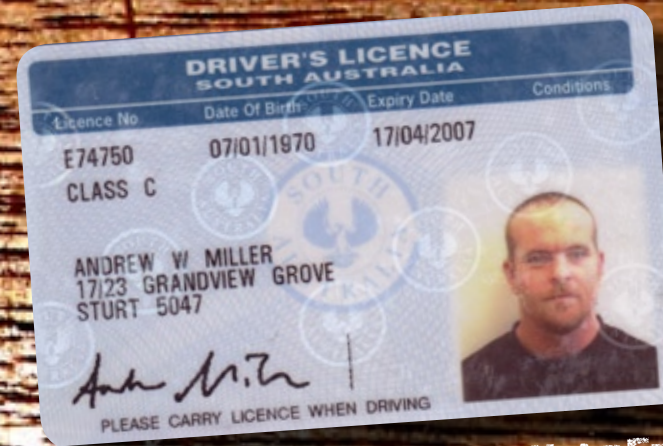
A LICENCE HOLDER