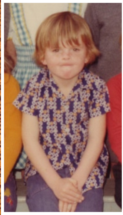
AN ANGRY KID